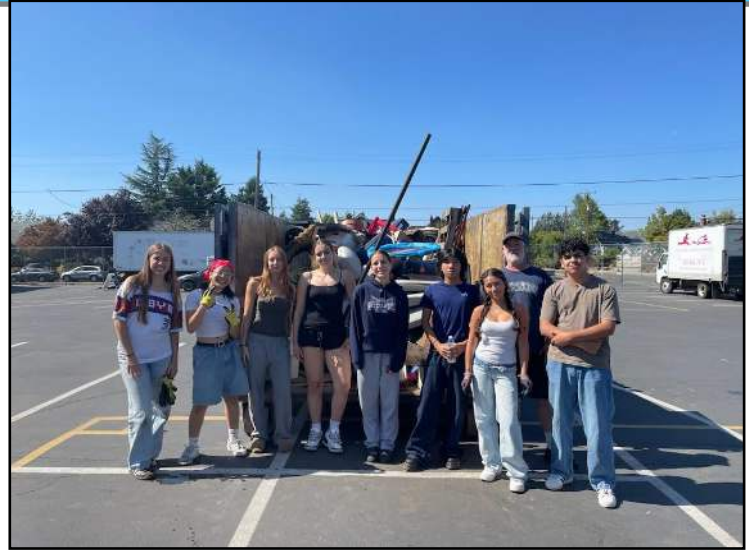
Clean up crew from McDaniel High School at 2025 Cleanup event.

Looking to get rid of items you weren't able to sell at the Garage Sale? Drop off approved items at the Neighborhood-wide Clean Up. We'll take your items to be reused, recycled, or disposed of at no charge. Visit RCPNA.org/Clean-Up for a list of approved items, our vendor list, and to learn more about what items are needed, and what can't be accepted.