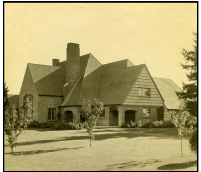
Rose City Park Golf Course as it looked in 1932. It is on the National Register of Historic Places

In May 1923, the City assumed management of the course. In 1932 the Rose City Golf Clubhouse was built and is now on the National Register of Historic Places. Come join the celebration and learn more about this notable site.