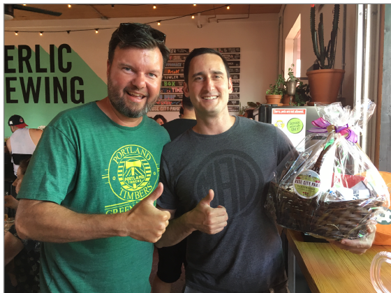
June 30th Baerlic Barley Pod Fundraiser & Raffle

We've also launched our RCPPP Committee, which is 14 members strong! The Committee has played a crucial role in fundraising, building community and business support, volunteering at events, and helping to keep this project energized!