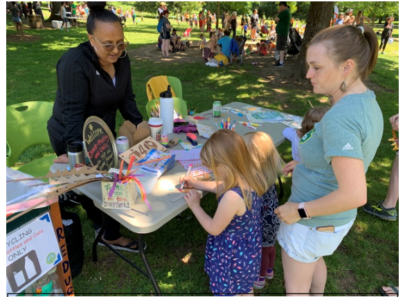
June 1st Play Day event

We still have a long way to go to meet our goal but the outpouring of support and enthusiasm from our neighbors has inspired us with renewed energy and inspiration.